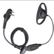
D-Earpiece with In-Line MIC & VOX EHM15