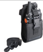
Nylon Carrying Case (Non-Swivel)(Black) NCN001