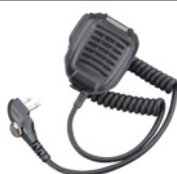
Remote Speaker Microphone SM08M3