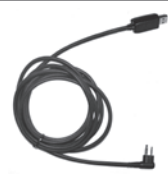
Programming Cable 2 Pin (USB) PC26